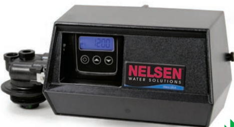
Pentair Fleck 9100 SXT Control Valve