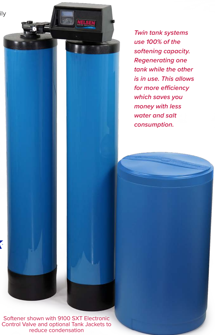
Softener shown with 9100 SXT Electronic Control Valve and optional Tank Jackets to reduce condensation

Twin tank systems use 100% of the softening capacity. Regenerating one tank while the other is in use. This allows for more efficiency which saves you money with less water and salt consumption.