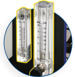
Permeate & Concentrate Flow Meters