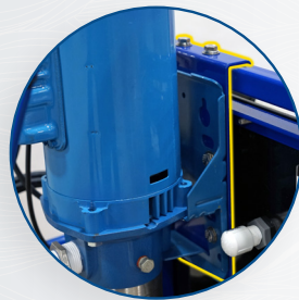
Easy Motor Mount Bracket

The NRO 440 Series is designed for Commercial or Light Industrial applications requiring flow rates of 1.7 - 13.8 gallons per minute (GPM). The NRO 440 Series features the durability of a powder coated steel frame, an optional complete performance monitoring package, and simple system integration.