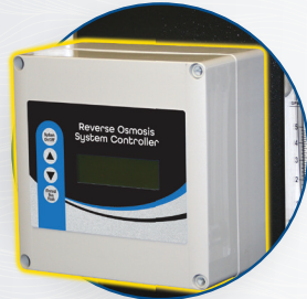
Optional - Control Box w/Low Pressure, Permeate TDS & Level Controls