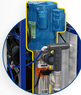
Multi Stage Booster Pumps