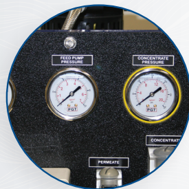
Liquid Filled Panel Mounted Concentrate Pressure Gauge