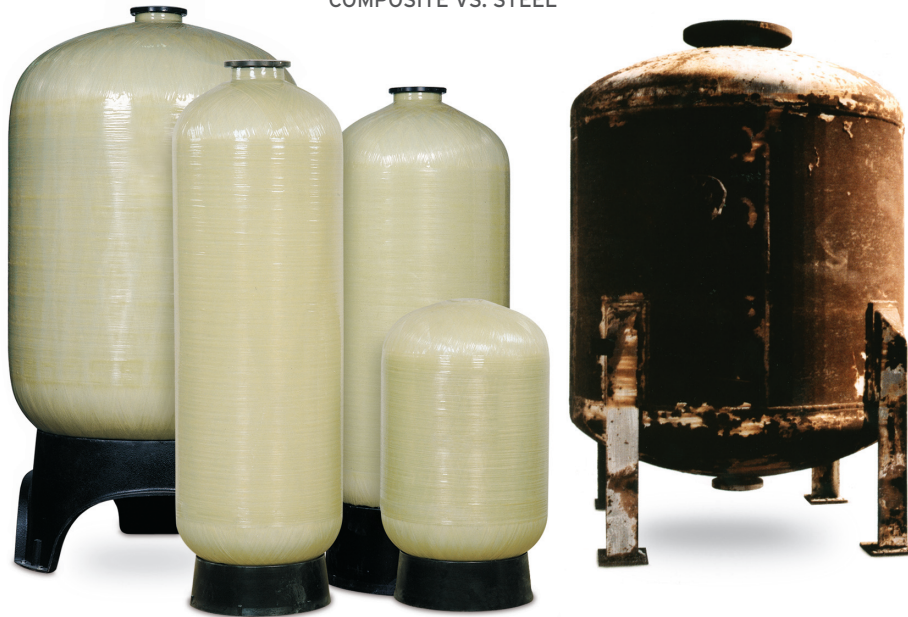
COMPOSITE VS. STEEL