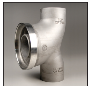
Side Mount Adapter