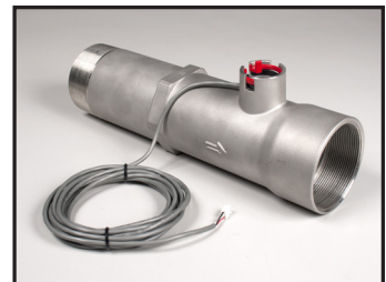
Optional 3" Meter